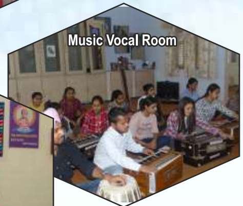
Music Vocal Room