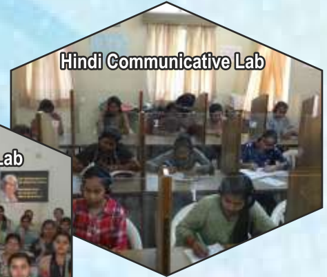
Hindi Communicative Lab