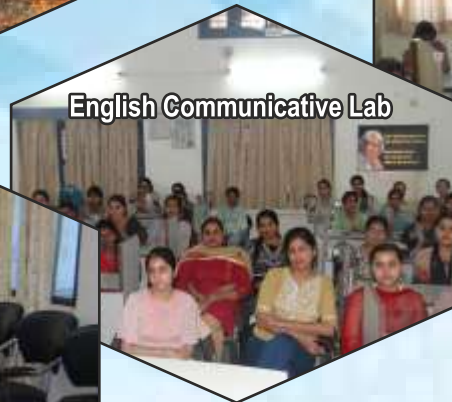
English Communicative Lab