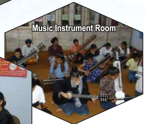
Music Instrument Room